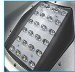
EPISTAR LED CHIPS