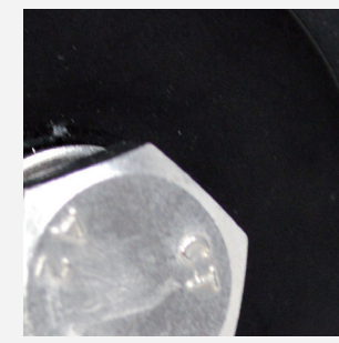
Use 304 stainless steel screws