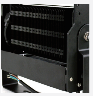
Independent power box design to support more power, which is beneficial to Light body heat dissipation, reducing light decay and prolonging service life