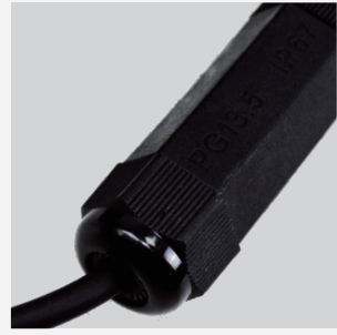
Internal wiring is waterproof, safe, Convenient.