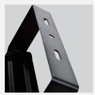
Refined iron phosphide bracket