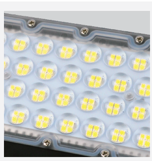
Import Philips LED lamp beads, Light efficiency>165LM/W