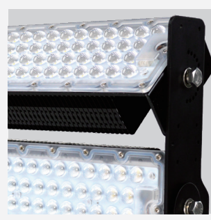
Single module adjustment angle light distribution, 8°/20°/40°/60°/90°/ 140*100° angleless PC cover