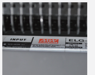
MeanwellELG or HLG driver