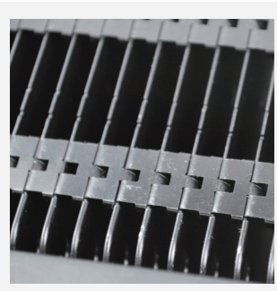
Using fins 1060 pure aluminum heat dissipation, air convection design, Better heat dissipation, heat sink 0.5mm