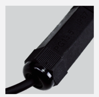
Internal wiring is waterproof, safe, Convenient.