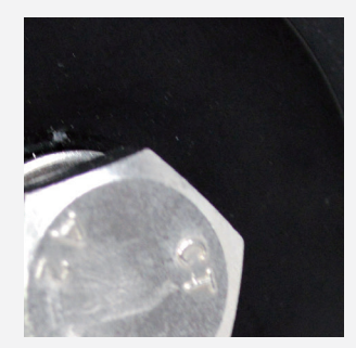
Use 304 stainless steel screws