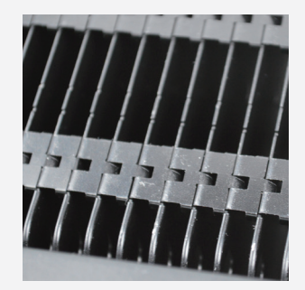
Using fins 1060 pure aluminum heat dissipation, air convection design, Better heat dissipation, heat sink 0.5mm