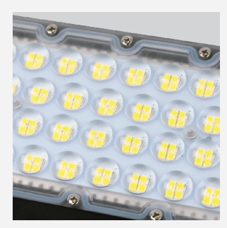
Import Philips LED lamp beads, Light efficiency>165LM/W