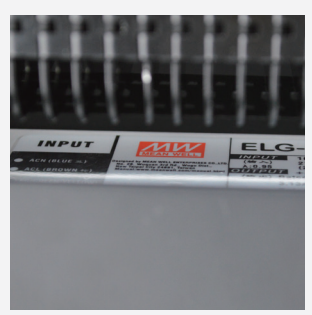
MeanwellELG or HLG driver