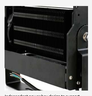
Independent power box design to support more power, which is beneficial to Light body heat dissipation, reducing light decay and prolonging service life