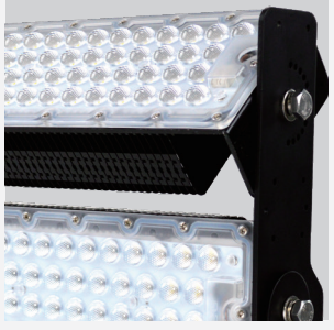
Single module adjustment angle light distribution, 8°/20°/40°/60°/90°/140*100° angleless PC cover